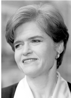
Deborah Lipstadt will deliver a lecture, “History on Trial: My Day in Court with the World’s Leading Holocaust Denier,” on April 10.