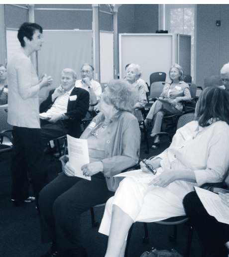
Guests of the Inside Jewish Studies at Carolina event, held last April, enjoyed presentations from faculty members and gained first-hand experience of what it's like to be a student at Carolina.

Of course, the economic downturn has posed unique challenges for institutions of higher education throughout the U.S. Today, private support means more than ever. Throughout the last six years, private donations have enabled us to hire new faculty, increase our course offerings so that we reach more students and maintain a vibrant public events program. Gifts of all sizes make a tremendous difference in our ability to sustain the momentum we've developed over the last six years. Please consider renewing your support today, and please know how much we appreciate the generosity of our friends and alumni!