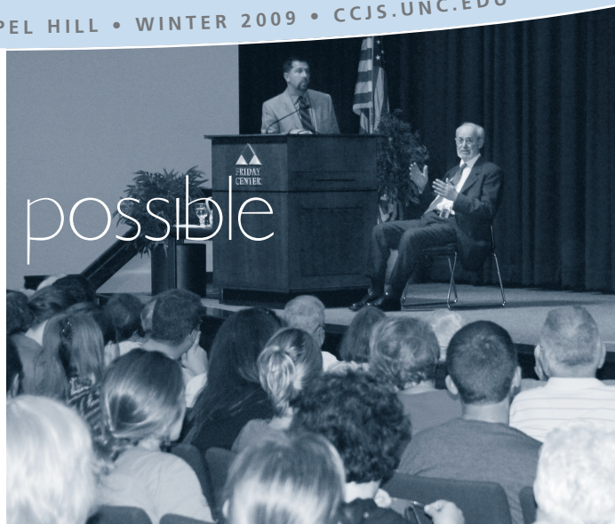
On September 14, about 400 students and community members attended the Eli N. Evans Distinguished Lecture in Jewish Studies given by Geza Vermes, who provided an overview of his 60 years of work on the Dead Sea Scrolls.